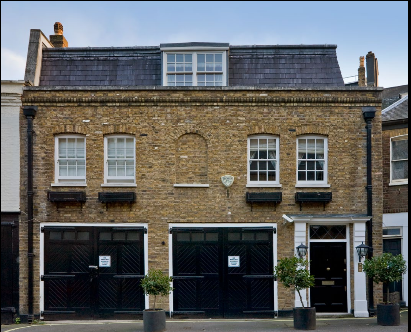
19 Hay's Mews